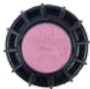
PGJ Reclaimed Available as a factory installed option on all models